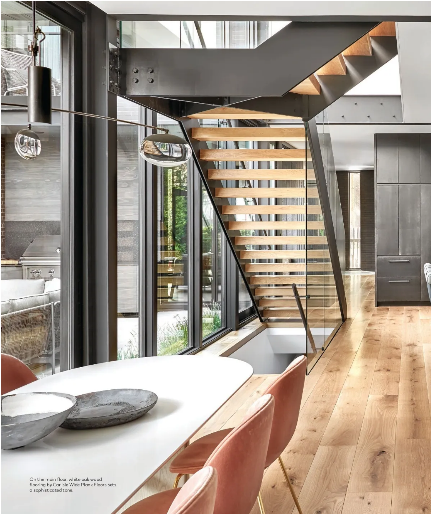
On the main floor, white oak wood flooring by Carlisle Wide Plank Floors sets a sophisticated tone.